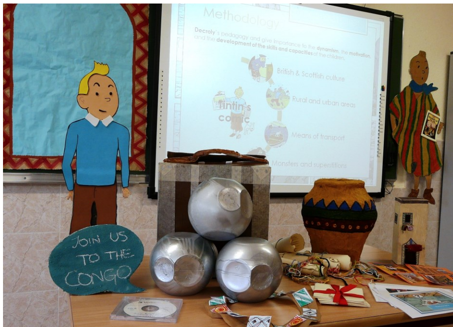
Figure 3. Handcrafted materials created by the students for their presentations.

Personally, I have to admit that I am really surprised by my students' incredible creativity. Their work went far beyond simply doing a piece of written work and an in-class oral presentation. They included lots of handcrafted materials, group dynamics, games, digital whiteboard resources, blogs and others based on the comic-centred activities; see Figure 3.